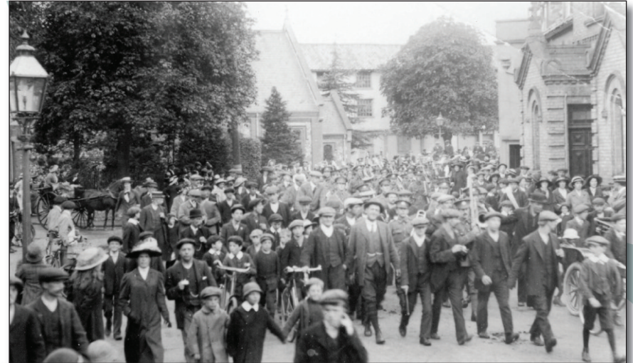
Mobilized men of the 4th Battalion leaving Diss to report to their headquarters at Norwich, 5 August 1914