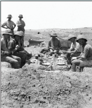
Officer's Mess in the field.