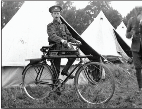
A fine study of a 6th Norfolk Cyclist in riding order, complete with his 'Long Lee' rifle 1913