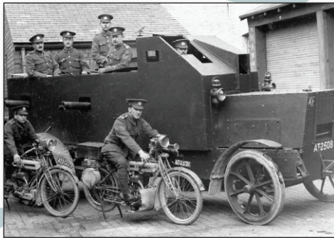
2/6th Battalion Motor Section with their armoured car passed to them for use on home service after it was condemned by the Admiralty for its thin armour.