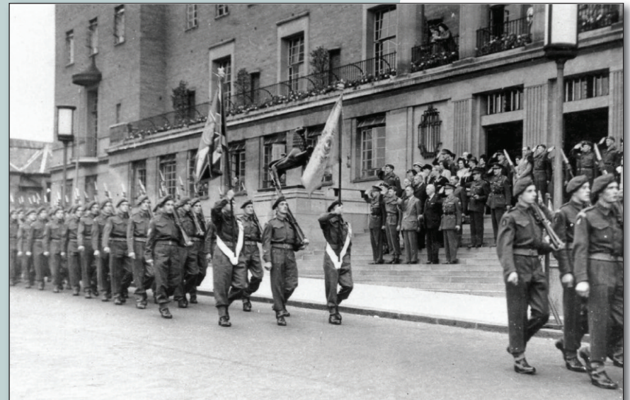
After collecting them from Britannia Barracks, where they had been lodged 'for the duration' the 4th Battalion parades its colours for the first time after the war in a grand march past, Norwich City Hall, 30 June 1947