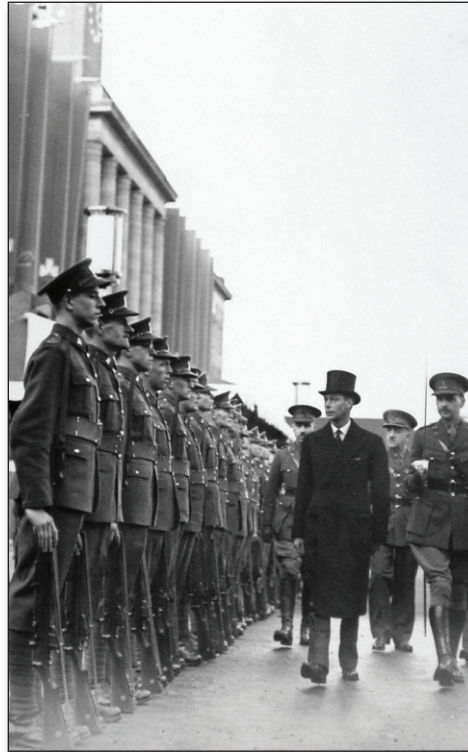
HM King George VI inspects the Guard of Honour provided by men of 4th Battalion on the occasion of the opening of the new Norwich City Hall 29 October 1938.